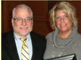
Benton CD Farm Receives State Award