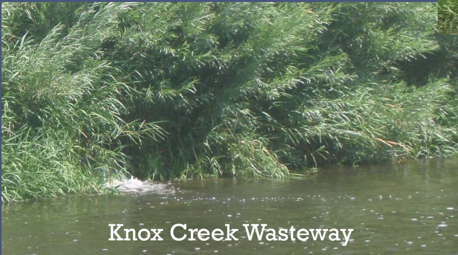
Knox Creek Wasteway