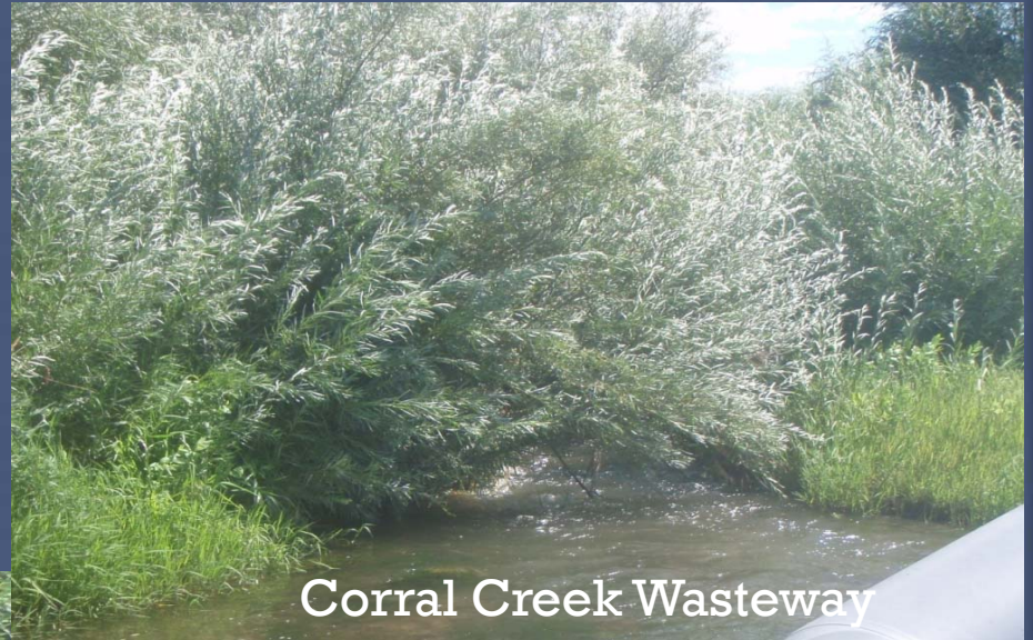
Corral Creek Wasteway